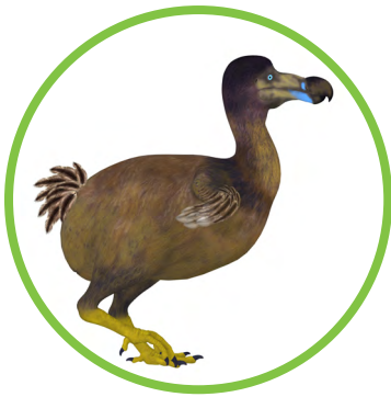
Extinction of the dodo bird, Mauritius.