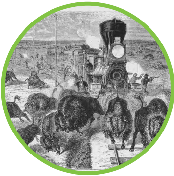
American bison face extinction, likely less than 1,000 animals (est. 60,000,000 in 1491).