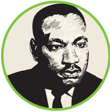
Martin Luther King – ‘I Have a Dream’ speech, Washington, DC.