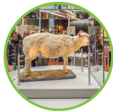
First cloning of a mammal (Dolly the sheep).