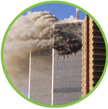
9/11 terrorist attacks.