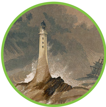
John Smeaton (who built Eddystone Lighthouse) declares himself first 'Civil Engineer'.