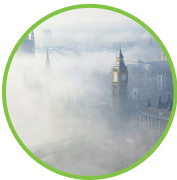
London's 'great smog' leaves at least 4,000 dead.