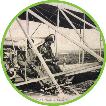
Wright Brothers inaugural flight.