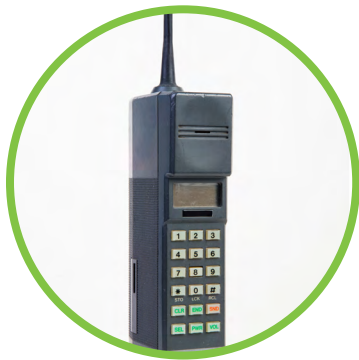
First handheld mobile phone demonstrated (Motorola).