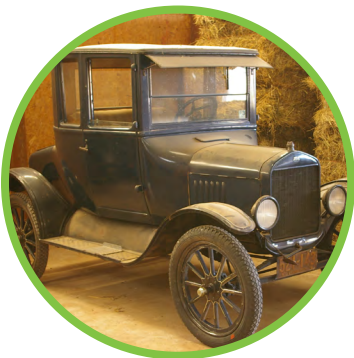
Ford's first Model T.